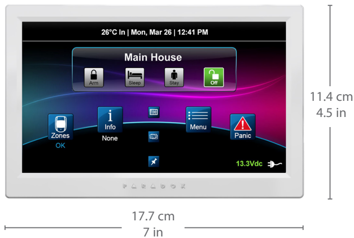
TM70: Intuitive Touchscreen